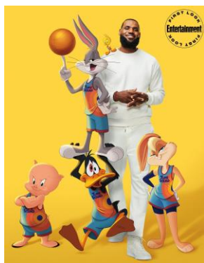
Space Jam: A New Legacy

Movies are shown on the Library's "big" screen. This fun event is free and open to movie lovers of all ages!